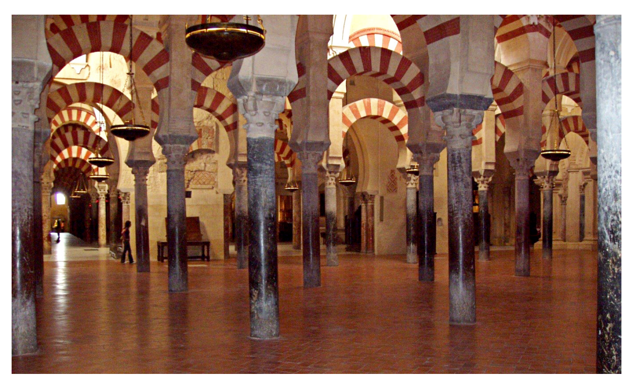
Picture 1. A picture with a sense of beauty showing not just arcades, but symmetric arcades in the Mesquita, in Cordoba, the South of Spain, by Spaten.

ultimately exclusion of individuals. Presumably some individuals will not meet the requirements put forth by the norm, and as a result they may be less financially rewarded – imaginably they might even go from hired to being fired! Furthermore, it is reasonable to assume that these individuals may also obtain poorer social ranking, earn less appreciation and perchance hereafter become socially vulnerable. This contemplation raises an intriguing question, namely whether coaching by one's immediate boss as in internal managerial coaching can be portrayed as an oppressive form of disciplining technique. Awareness of such issues related to power is essential when power is not something you can decide whether should exist or whether it would be better if it did not exist. These concerns would presumably be linked to the notion of symmetry in the coaching relationship. On account of this, the next paragraph will consist of a further discussion on power along the notion of symmetry.