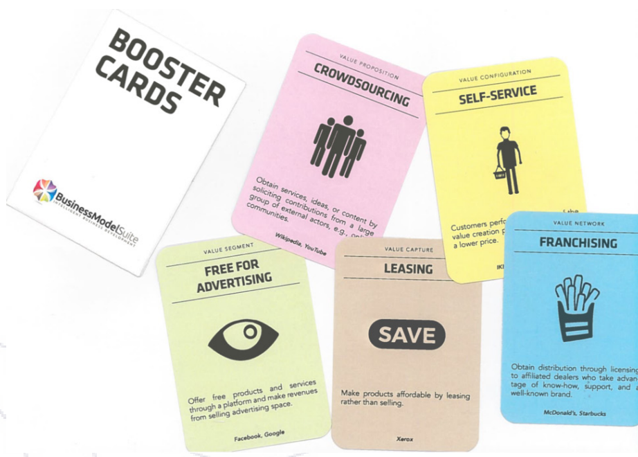
Figure 1: Examples of booster cards.

The cards are based on 71 different BM configurations identified in the work by Taran et al. (2016). Each card in the deck represents a specific configuration and contains a short description of the configuration and real-life example to strengthen the analogy further. The description might give room to gain context-free ideas, but if the students are having issues with generating ideas or understanding the concept, the real-life examples often spur them in the right direction. An example can be found in Figure 1, where the configuration 'Free for advertising' provides both a short explanatory text of the general concept and empirical references (in this case of Facebook and Google).