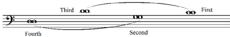
Figure 4: The Tuning of the Tunisian 'ūd 'arbī

This octave interval is central to my argument about the 'ūd 'arbī's intersensorial experience which touches on other local factors embedded in its African context.