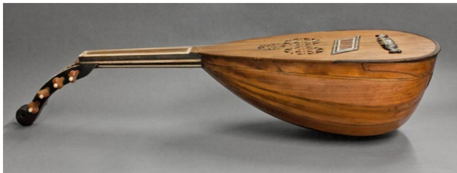
Figure 1: ‘ ūd ‘arbī (1867).

The ‘ ūd , a plucked instrument, is the most prominent musical instrument in the Arab-Islamic world. It developed an unusually large following throughout the twentieth century, in both the Arab world and outside, capturing the imagination of musicians more than many other Middle Eastern traditional instruments. The recognized standard Arab/Egyptian model (‘ ūd sharqī , oriental ‘ ūd , also called ‘ ūd miṣrī , Egyptian) is the most commonly used type, along with the Turkish model, and there are also various models from Iran, Greece, Iraq and Syria. Several practices and styles of ‘ ūd co-exist in Tunisia, as well as a unique type recognized as indigenous and genuinely Tunisian, named ‘ ūd ‘arbī , today also known as ‘ ūd tunsī .