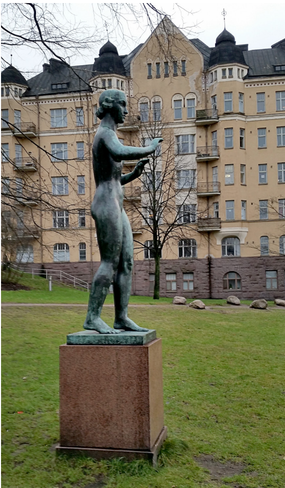
Figure 2. Convolutus by Viktor Jansson (modelled after teenage Tove Jansson).

In their analysis of crime scenes as mediatised spaces, Sandvik and Waade (2008) observe that spatial augmentation – the enhancement of space through senses and emotions on the basis of media connections and through the use of media – can occur, among other means, by narrativization and fictionalisation. During our walk, it is the narrative