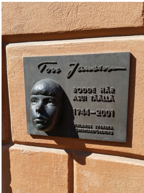
Figure 4. Tove Jansson's memorial plaque (by Viktor Jansson).

The reconstructed biographical narrative is by no means linear; it jumps back and forth in time. It consists of flashbacks – not Jansson's own, but mine, when I consult the sources and discover a new piece of information or remember a random detail from her autobiography: