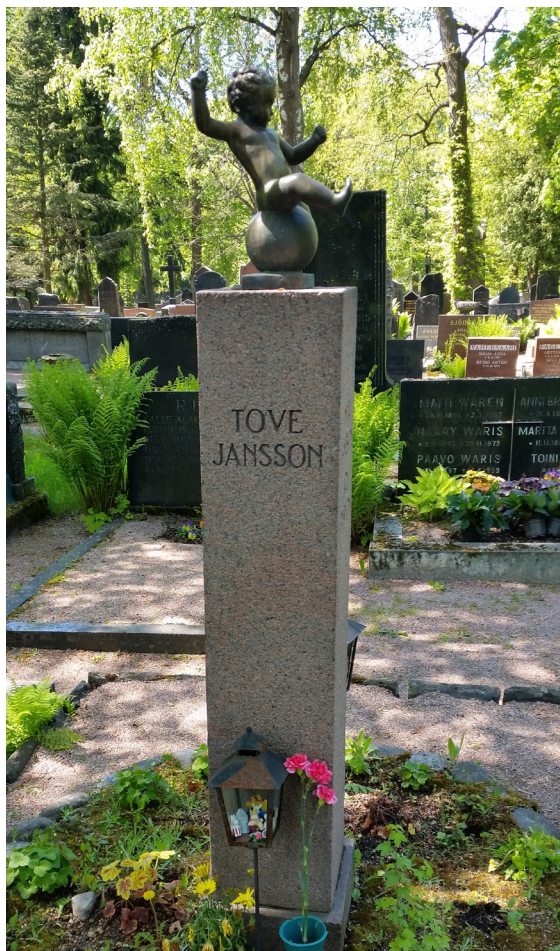
Figure 3. Tove Jansson's grave, Hietaniemi cemetery. Photo by author, 2017.

of Jansson's life that gets told and laid out across the city, as is reflected in the title of the Helsinki Art Museum's itinerary, "The life path of Tove".