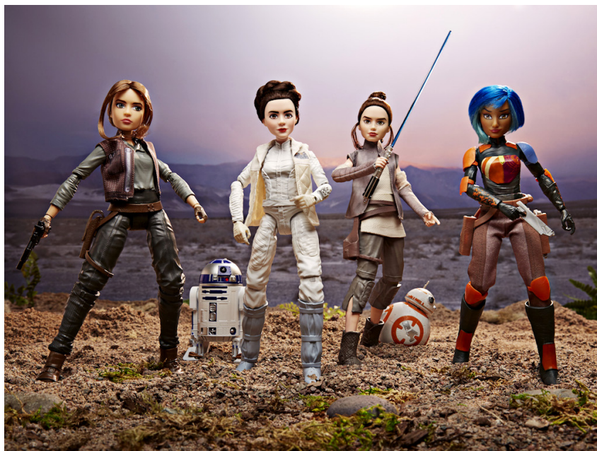
Figure 1. Star Wars: Forces of Destiny cast of female heroine characters. Picture from initial press release.

The way in which the franchise appeals to girl and women fans is just as important as whether it does this at all. Forces of Destiny seems to be a direct response to the growing demands for more inclusion of female fans in the Star Wars franchise. In her insightful analysis, Megen de Bruin-Molé (2018) points out that the Forces of Destiny series was a low-risk investment by Disney, freely distributed on YouTube (rather than Disney XD, where Star Wars: Rebels and part of LEGO Star Wars aired). The episodes often included cute and cuddly companions, underscoring the fact that it ultimately served to sell toys to girls and “encourages girls and women to ‘buy into’ a very specific and peripheral kind of fandom” (ibid.).