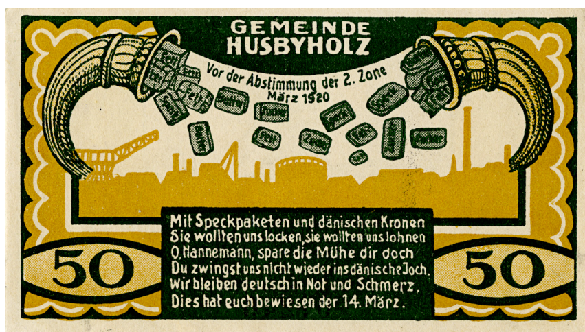
Figure 4: Emergency bank note from Husbyholz, issued July 1921. ADCB.

(“Not und Schmerz”) in spite of the Danish attempts to “lure” (“locken”) people into voting for Denmark with food aid and money (ADCB, D9095-5,3).