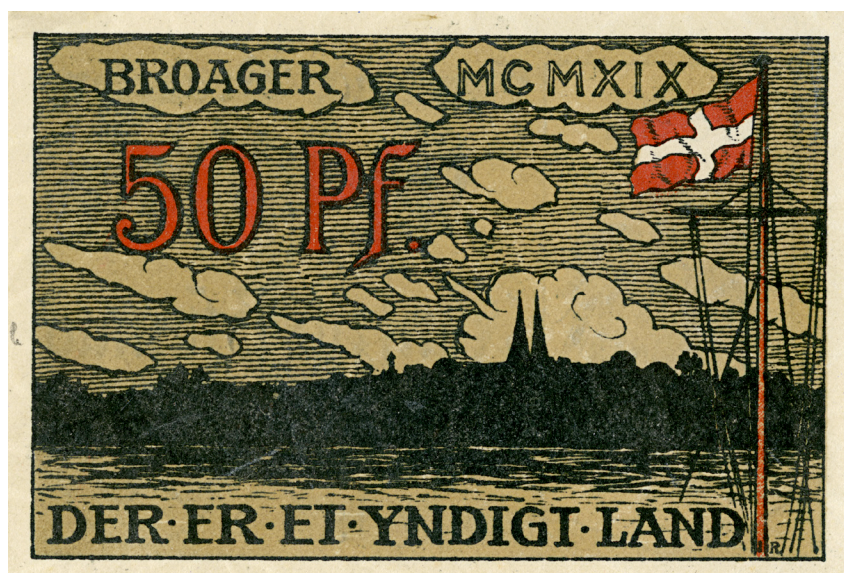
Figure 2: Emergency bank note from Broager Spare- og Lånekasse, issued December 1919.

Both Danish- and German-minded plebiscite money was issued before the plebiscites in Northern Schleswig held on 10 February 1920. In the beginning of the plebiscite campaign, the area was still governed by German authorities. As a consequence it was still a challenge to produce plebiscite money with Danish motives, as experienced by the municipality in Broager when they circulated a new note on 8 December 1919. The motive of this note shows a view of Broager Church from the sea in the twilight and to the