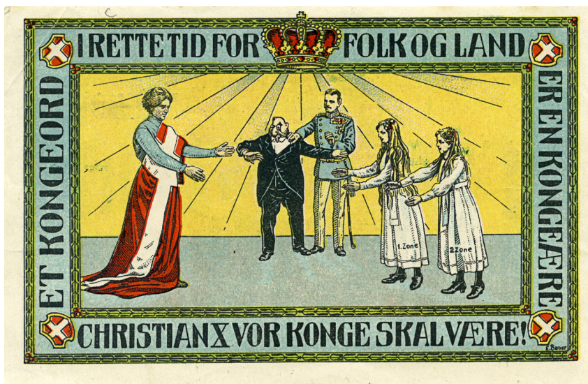
Figure 5: Emergency bank note from Gramby, issued Easter 1920. ADCB.

was dissatisfied with the prospect of Flensburg becoming German. He therefore dissolved the Danish government on 29 March 1920 in what proved to be a futile attempt to change that decision.