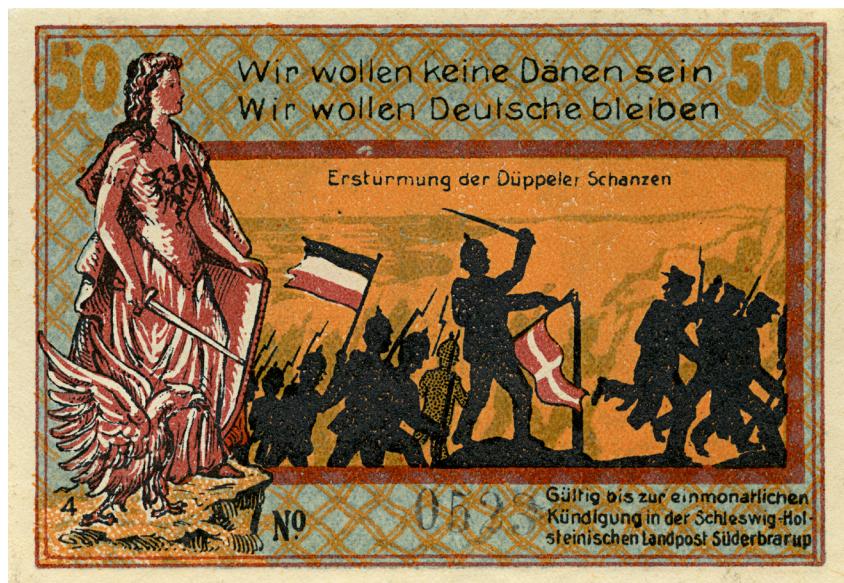
Figure 6: Emergency bank note from Süderbrarup, issued 1921. ADCB.

on Anglia of no less than 8 notes with different historical motives, including this tribute to the German victory at Dybbøl in 1864 (ADCB, D9095-5,3).