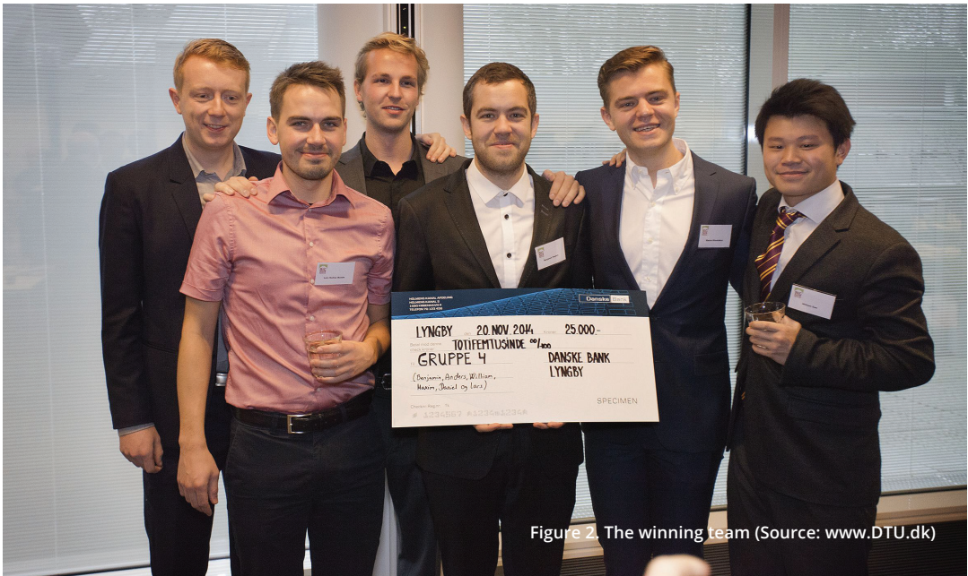
Figure 2. The winning team

current energy sources for the municipality’s own buildings, they could present a solution that could make the municipality more cost- and energy efficient. While they did not have such detailed data for all the privately owned property in the municipality, they could calculate the energy efficiency of solar panels based on the roof size and direction and then calculate estimated energy savings. Hence, the solution delivers openly available content, which can help the citizens of Lyngby-Taarbæk municipality make informed decisions about how to influence their own energy costs and eco-footprint. The solution was simultaneously addressing the need for more cost efficient municipality, the need for improved citizen services and the ability to improve energy efficiency and reduce CO 2 emissions.