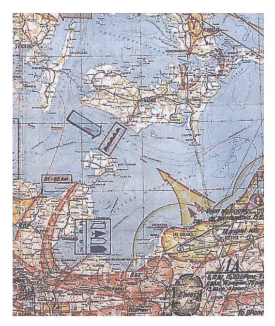
Figure 3. Subset of the map focused on Fehmarn Belt with indications of resistance or resilience.

The map of the offensive of the Coastal Front is not just a spatial enterprise detailing what military unit goes where, it is also temporal in the sense that it specifies which military unit goes where and when. Various indicators are inserted onto the map, detailing the temporal expectations of the planners; red lines showing the extent of the operations after one day of fighting, after two