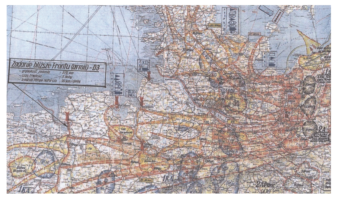
Figure 4. Detail of the map covering Northern Germany and parts of Holland showing the very precise use of time in the plan.

map concerns itself with the initial onslaught of day 1, which was planned to develop along the East-West German border and into northern Germany (see figure 4). Here we find very detailed planning, down to division level, with precise instructions concerning the deployment of tactical nuclear weapons, the relative position of infantry and armour and general directions of movement. As (plan) time goes by, the planning becomes less and less detailed and as the planning approaches day 5 and 6, it seems almost to be an expression of intent rather than actual planning. One exception to this is the attack on Zealand, which will be carried out on days 5 and 6 after the defeat of NATO forces in northern Germany, and in Jutland and on Funen in Denmark. Only then will 6th Airborne Division of the Polish forces be deployed together with the 15th landing division and a number of operational nuclear warheads in the final conquest of Denmark, which by this time is limited to Zealand and the operations of the Danish 1st and 2nd Zealand Brigade. Hence, time is not a gradual, linear progressing factor. Rather,