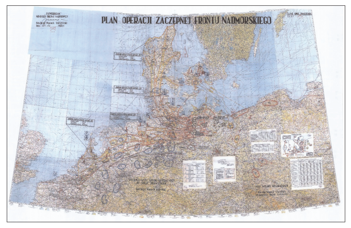
Figure 1. Plan of an Offensive Operation of the Coastal Front. The heading is quite clear, as well as the authorization of Defence Minister Jaruzelski (top left) on 25 February 1970. Classified as Tajne Spec Znaczenia, equivalent to NATO Cosmic Top Secret, the base map seems to be composed of a number of 1:500.000 map sheets, made by the Polish General Staff and based on Soviet maps.

The map itself is designed in a dramatic design language, with large red arrows pouring out of the right-hand, eastern, part of the map, cutting across Western Europe, unstoppable by forests, rivers and other natural obstacles and unaffected by major cities and political lines of division.