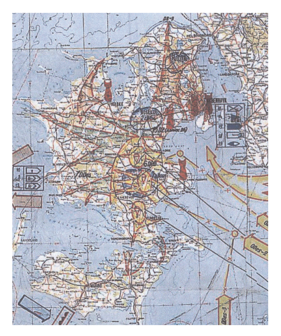
Figure 5. Detail of the map showing the final attack on Zealand and clearly illustrating the five nuclear warheads planned to be used in the final days of the operation.

Turning to the cartographic representation of the military forces and actions on the map, we notice that these draw on a specialized form of cartographic symbolization, used by military organizations to visualize military movement and actions. From a Danish perspective, the standard symbols used by NATO are probably the most known set of such symbols, as they have been used both by the Danish military as well as in numerous computer games and movies. However, the symbol used in the Polish attack plans were aligned to