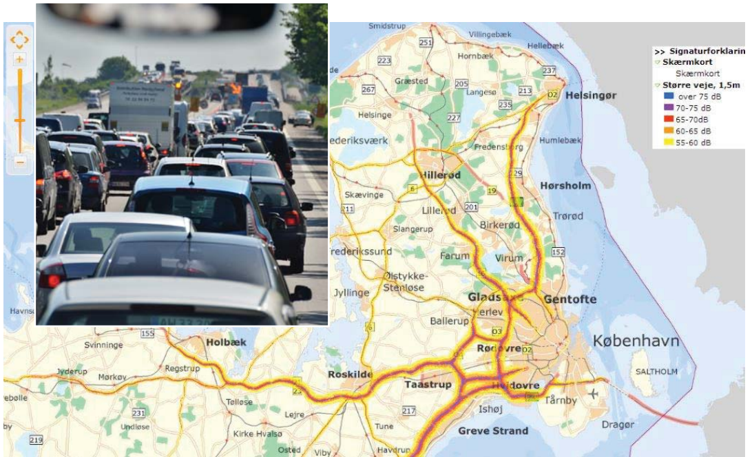
Figure 2. Example of strategic noise maps for large road in the northern part of Zealand – daytime values.