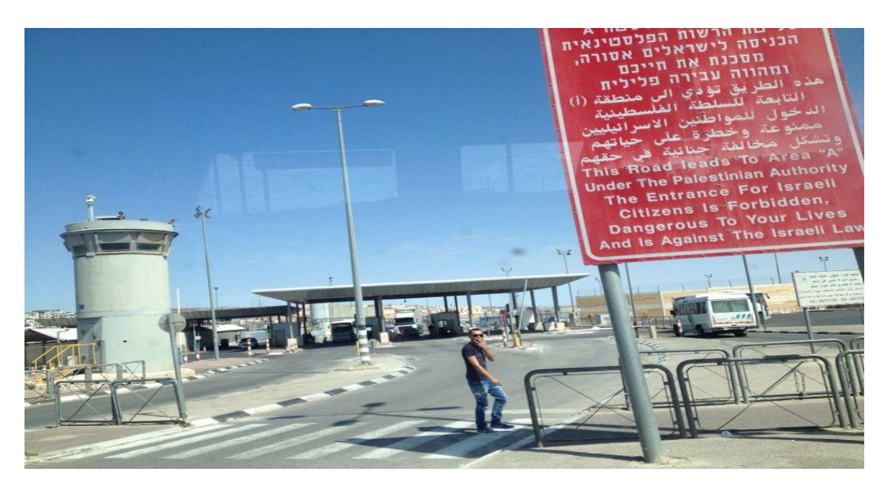
The warning sign.

Schiller et al. (2013) have pointed out the crucial role of which imaginaries play, in both determining and defining the (im)mobility of nations and people (p.191). In this case, it seems that the negative imaginaries of Palestinians, along with Israel's implementation of borders, checkpoints and security procedures, play a crucial role in defining and determining both the tourist flow to the West Bank, as well as the Palestinians ability to move. This is further confirmed during several of the interviews with the local tourism actors, as they expressed that the negative imaginaries about Palestinians, are problematic in two ways. Firstly, the negative stereotypical images of Palestinians make it difficult to increase the tourism activities in Palestinian territories, and secondly, the negative imaginaries of Palestinians assist in legitimizing the restrictions and limitations of the Palestinians mobility. Thus, this demonstrate how the Israeli mobility regime operates on several levels. Aside from the regime's practical and visible features, such as the checkpoints and military zones that restrict local Palestinians in their physical mobility, the hidden elements, such as the tourist's response to the signs and the negative imaginaries, also play a great role in undermining Palestinians' ability to move and chances to develop a tourism sector in Palestine on equal terms as Israelis.