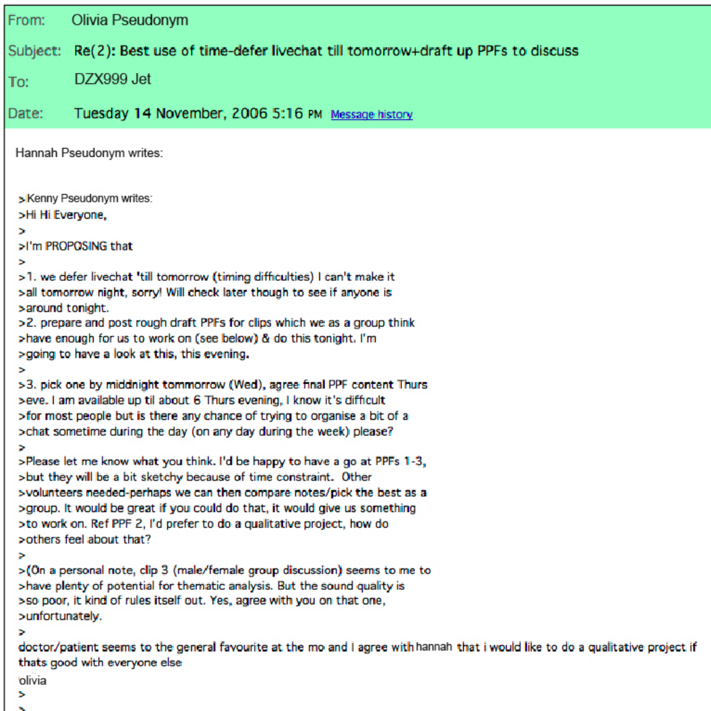
Figure 3: Posting 3. All text in the body of the posting appears as black text on a white background

In Posting 2, if Hannah presented both proposals and responses in the default 10pt Arial black typeface, it would take a lot of work for readers to develop a reading path through her posting that would distinguish her contributions from Kenny's quoted input. Figure 3 shows the next posting in this thread, which demonstrates how much extra work is involved for readers if clear reading paths are not established. At first glance it is not at all clear who is the author or which new text has been added to the discussion.