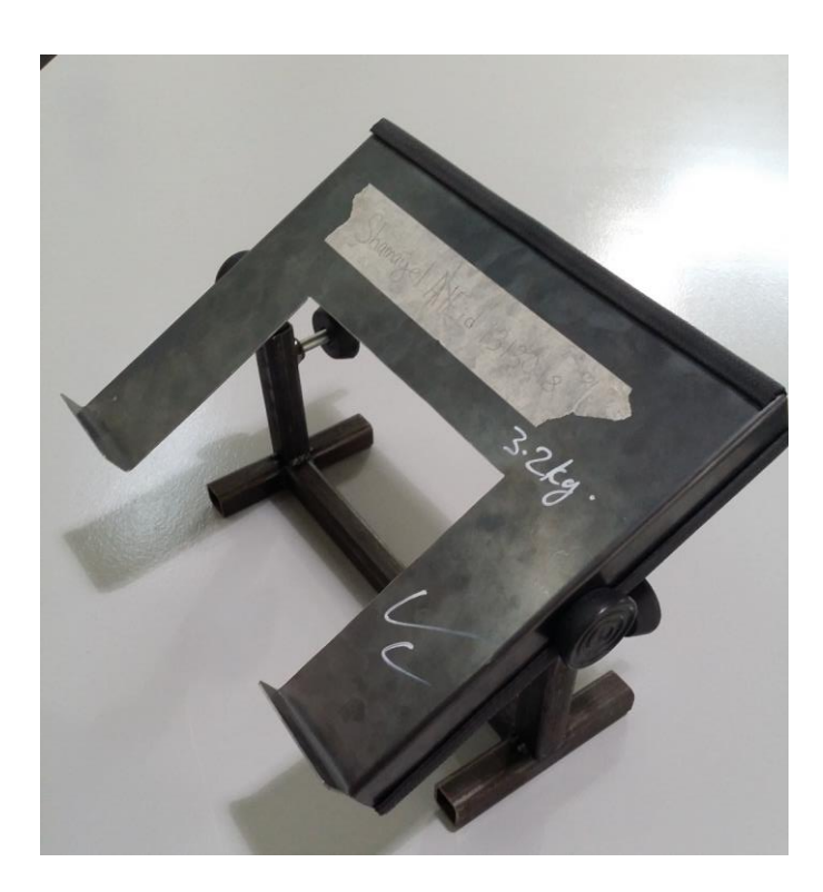
Figure 2: Team 1 the manufactured laptop riser