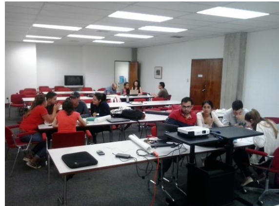
Photo 1 and 2: World Café or Workshop, Workshop VI. Source: Taken by the authors. 2017.

This strategy consists of the initial participation of one member per group, in order to explain their urban design proposal; which is followed by the rotation, every 15 minutes, of the others member's teams; until everyone knows the proposals of the different groups, generates opinions or contributions about it, and returns to their home group.