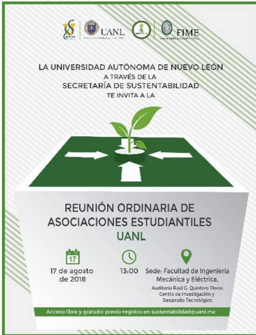
Figure 4. Publicity for an internal students forum in Sustainability at the UANL.

PBL courses don't have the responsibility or the objective of solving real world problems. Problems are greatly motivating excuses, fertile ground for knowledge and skills to grow from confronting them. However, when contextual learning is relevant to the students of PBL courses, there is great potential for projects to take a life of their own and transcend the limits of their intended goals.