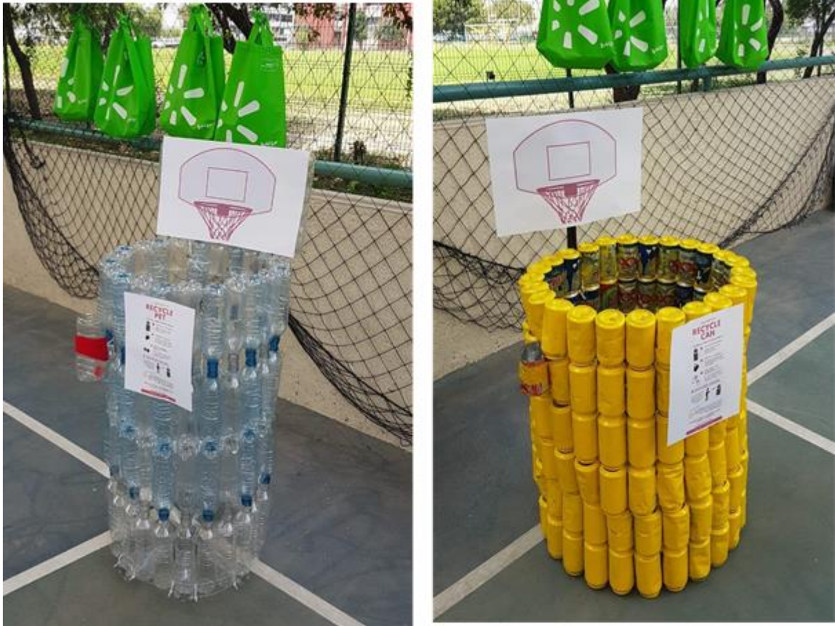
Figure 3. Intuitive pots designed by the students.

Between the 9 th and the 13 th July the group prepared its participation at the previously mentioned event. The students built a brand and they called the team “ Garra Ecológica ” (Ecological Claw), inspired by the university’s sport teams nickname and mascot, Tigers. Also, the team made a sustainable Kit for the participants that includes Tupperware, eco-bags, reusable silverware and Thermos. On Friday 13 th the recreational activities and the sustainability campaign started at the Faculty of Public Health and Nutrition.