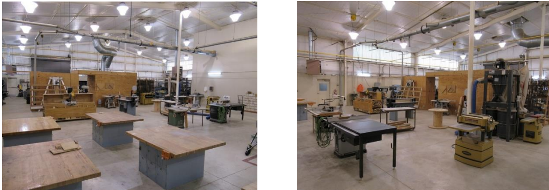
Figure 1. The woodworking lab facility for the selected class.

hour lab per week. Figure 1 shows the woodworking area that allows exposure to the machines and hands-on practices typically found in industry.