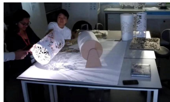
Figure 1. One of the tutorials with the selected team investigating the option of inserting a light feature in the drum.

The project began with a briefing and workshop where the TCC research team and interdisciplinary partners presented their expertise. Students then received tutorials on both design and scientific elements before project proposals were reviewed by TCC members and associates. Once selected, the student team participated in weekly tutorials with TCC researchers and exhibition designer Claudio Quintana, receiving design critiques and feedback from experts at key stages of development (see Figure 1).