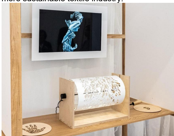
Figure 3. The Catalyst installation close up.

With these conceptual guides, the experimentation process was governed by methodologies from experimental design practice, including embedded research processes, informed speculation, iterative audience and materials testing, and collaborative/connected praxis. Early ideation processes led to an agreement that the work should entail three elements: learning through playful interaction; an interplay between human and nano-scales; and the engagement of the layperson as a stakeholder in the recycling process. The final outcome produced from within this framework was a piece titled Catalyst (2022) (Figure 3, Figure 4), wherein the audience becomes the catalyst in the transformation of textile waste into materials in biobased recycling. It includes a tactile sculpture (a rotating drum to be operated by visitors), a visual display illustrating the production of bacterial cellulose (Figure 5), and an evolving soundscape linked to these. Together, the three elements form a narrative, wherein publics are invited to play the role of the 'catalyst' in biotech processes creating a more sustainable textile industry.