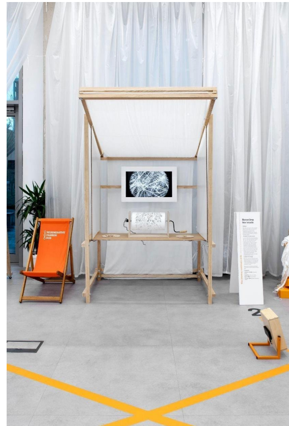
Figure 4. The Catalyst in the exhibition space.

context to arise in three areas: technical comprehension, emotional engagement, and agency.