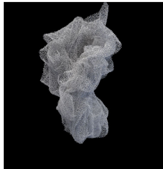
Figure 5. One of the stills from the video which portrayed the journey from the nano-scale to the materialisation of the bacterial cellulose into a textile-like material.