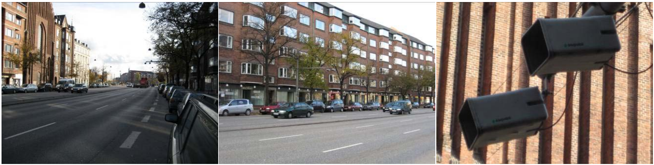
Figure 1. Left and middle: The two video cameras mounted on hanger at the street of Åboulevard in the direction towards the city centre of Copenhagen. Right: The two video cameras.