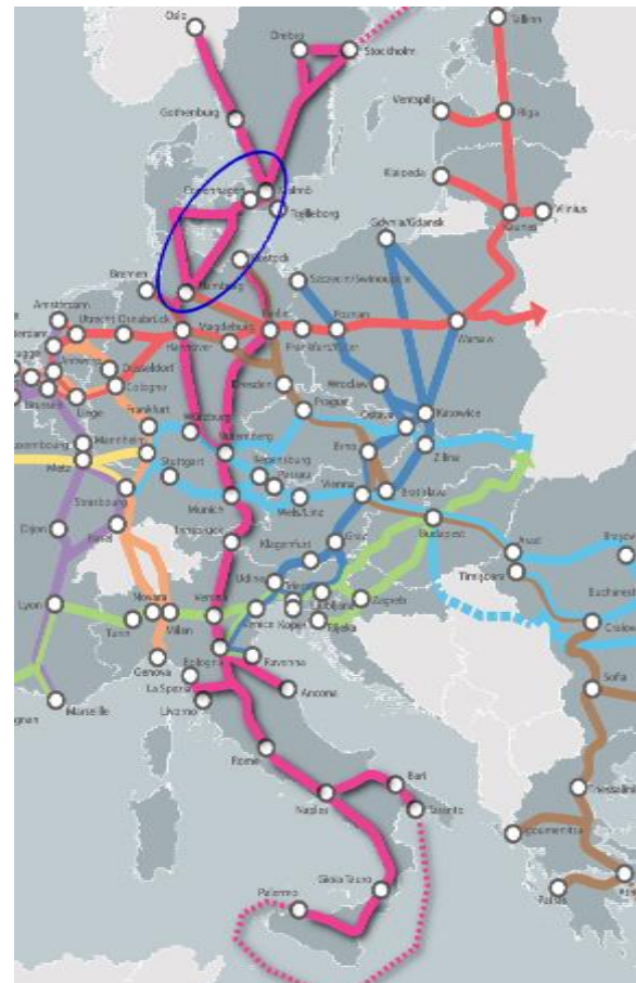
Figure 1. Ten-T corridors and case region

The Swedish initiative was paralleled by a number of EU financed Interreg projects dealing with green freight transport corridors such as the Supergreen project, East West Transport Corridor, Scandria, Sonora, and Transbaltic. Many of these projects use the same definition based on a greening of freight transport through co-modality and efficiency (Engström, 2011). One pioneering project was the Supergreen project, which worked on identifying green freight corridors within the European transport network, and later became a basis for the future development of green corridors at the European Commission (Schulze,