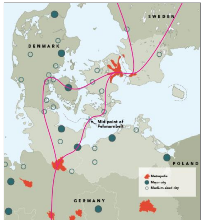
Figure 2. Scandinavia-Mediterranean corridor in the Fehmarnbelt region

The Ten-T corridors aim at reducing the environmental of the European transportation system as a whole, by increasing transport efficiency and by moving transport flows from roads to rails and waterways. In order to do so, it is vital to establish coherent corridors that can out-compete the existing road system for long distances. However, the establishment of such corridors will create transport flows through regions that did not have them and increase existing ones. Such an increase of transport flows is likely to have an impact on both the environment of the territories they cross and on the overall CO 2 balance of the EU. The