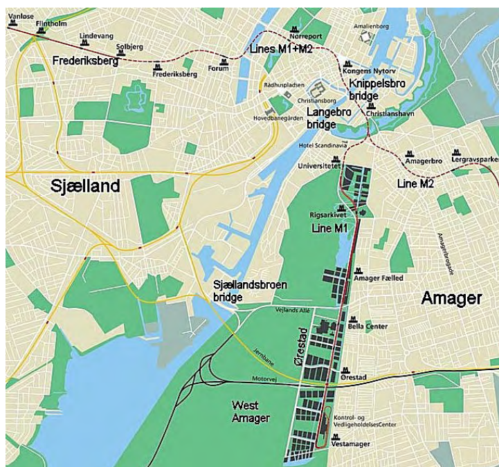
Figure 1. Alignment of the M1 and M2 metro lines

The alignment of the M1 metro line in west Amager largely corresponds to the 1961 plan. The new town Ørestad will expand over the next 20 years to an area of 310 hectare, providing 60,000 jobs, 20,000 education places and 20,000 dwellings. Some larger companies have built new offices in Ørestad: Telia, Copenhagen Energy, Keops and Ferring. The Danish Broadcasting Corporation transferred all its activities to a new television centre in Ørestad in 2005. The University of Copenhagen has been enlarged in the area, and the construction of an IT University is finalised.