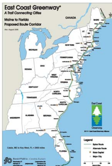
Figure 1: The East Coast Greenway trail map (ECGA 2006 version)

The East Coast Greenway Alliance (ECGA) was founded in 1991 and is the non-profit organization that has as its mission to create the East Coast Greenway (ECG), a 3,000 miles long bike and walking trail along the US east coast from Maine in the North to Florida in the South (figure 1). The trail is the first shared use urban trail system of its kind and magnitude in the US and it connects 25 major cities, cuts through 16 states, 90 counties and more than 300 municipalities. The history of the ECG dates back to a bicycle conference held biannually on the East Coast during the 1980's. Nine regular participants of the East Coast Bicycle Conferences met in New York City in November 1991 and formed the ECGA (ECG 2001:6). The ECGA likens the ECG to an 'urban Appalachian trail' drawing upon the image of the legendary 'Appalachian Trail', a hikers-only ridgeline trail developed during the 20 th Century.