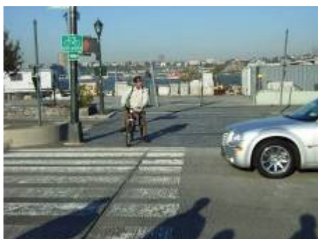
Figure 2: Biking in the ‘land of the car’

The rationale behind the ECG is partly to create a recreational mobility space for muscular powered mobility forms, and partly to contribute to a safer and healthier mobility practice amongst people living nearby the trail. The shifting of commuters and urban travelers from cars to bikes is thus an underlying value even though this is certainly not the main criteria of success here in the ‘land of the car’ (figure 2).