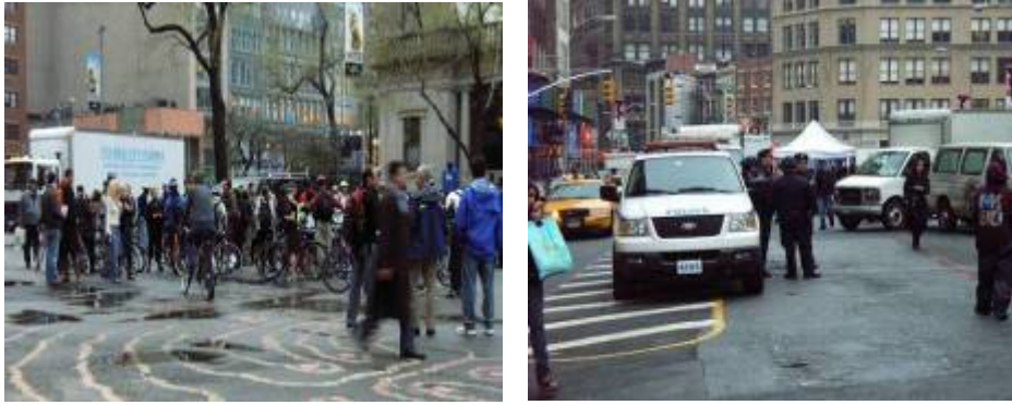
Figure 7: Critical Mass, New York City, April 2007

Due to the massive presences of NYPD representatives and the bad weather things were a bit slow and indeterminate for a while. Then the word circulated that someone had suggested simply; 'to go elsewhere'. Then the event took on a self-organizing quality and the idea spun into a proposal to take the bikes to the subway and in this way detach the NYPD surveillance and then surface in another part of town let loose from the eye of the authorities. On Saturday, April 28, 2007, the day after the CM event in New York City there was the following account of the event at the pro-bike/pro-CM ' Bike Blog ' under the heading 'Critical Mass takes off...on the Subway?':